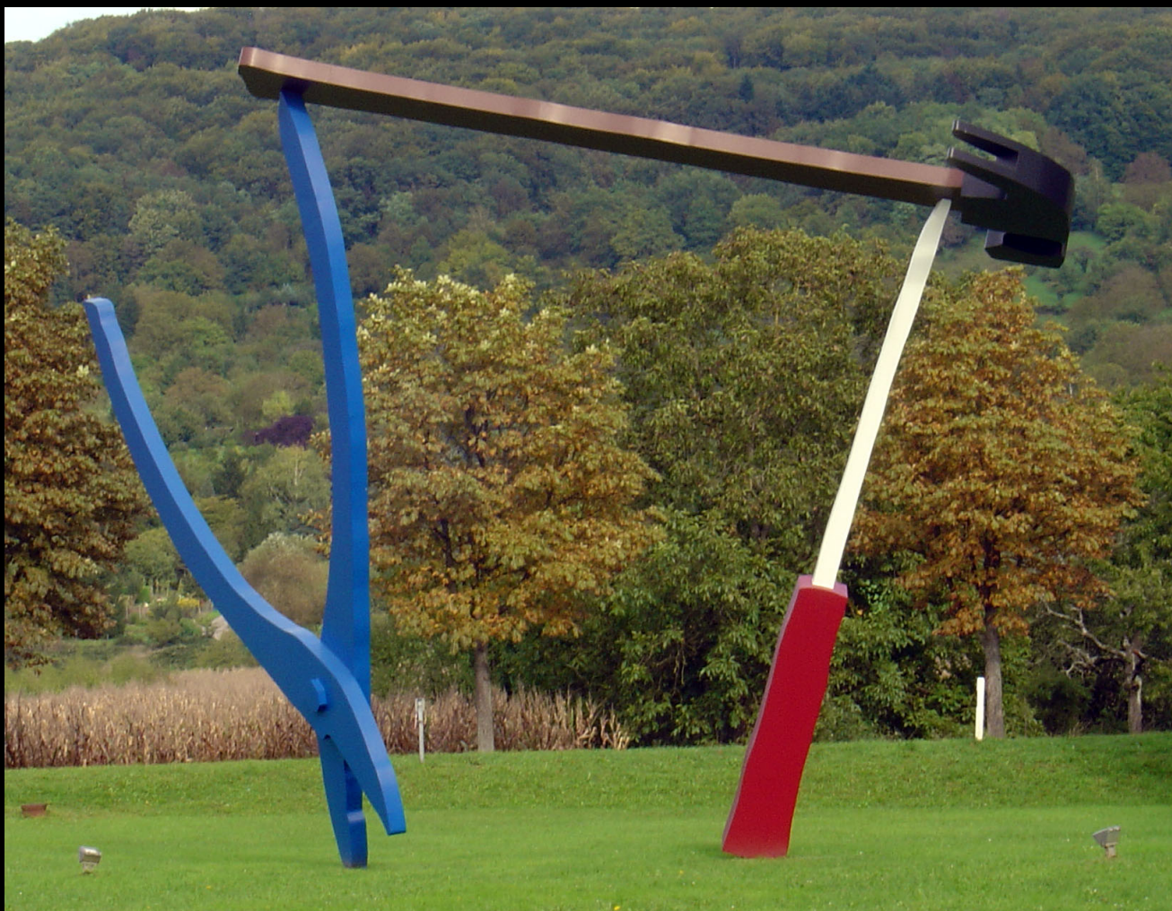
Balancing Tools, 1984 Steel painted with polyurethane enamel Vitra International AG, Weil am Rhein, Germany